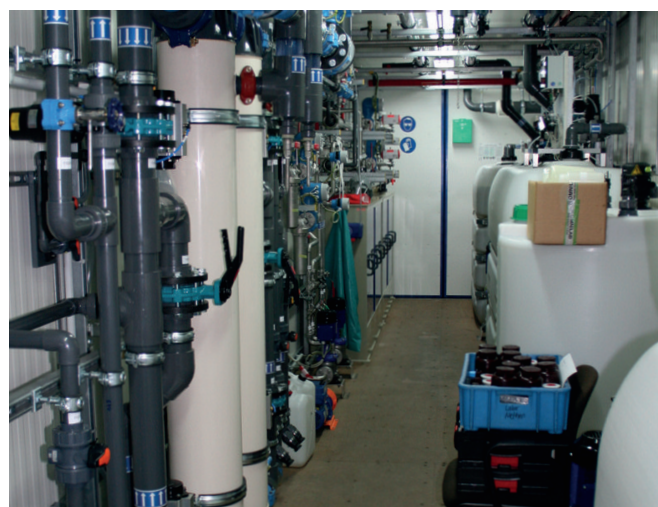
Figure 1: MULTI-ReUse pilot plant in Nordenham

Therefore, for the reuse of effluent water a further treatment is necessary. In the following, the different service water qualities produced at the pilot plant are introduced (see table 1) and the applied process combinations described.